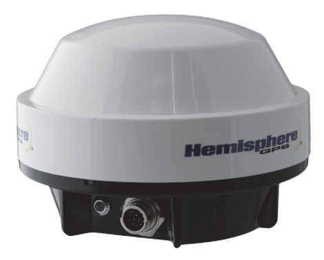
Figure 1-1: A325 smart antenna

Note: Throughout the rest of this manual, the A325 Smart Antenna is referred to simply as the A325.