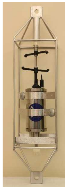
ACM-PLUS-7000 (Deep) Shown with optional CTD and 5-ton Frame