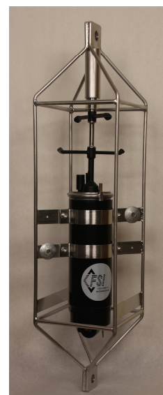
ACM-WAVE-PLUS shown with optional CTD and 5-ton Frame