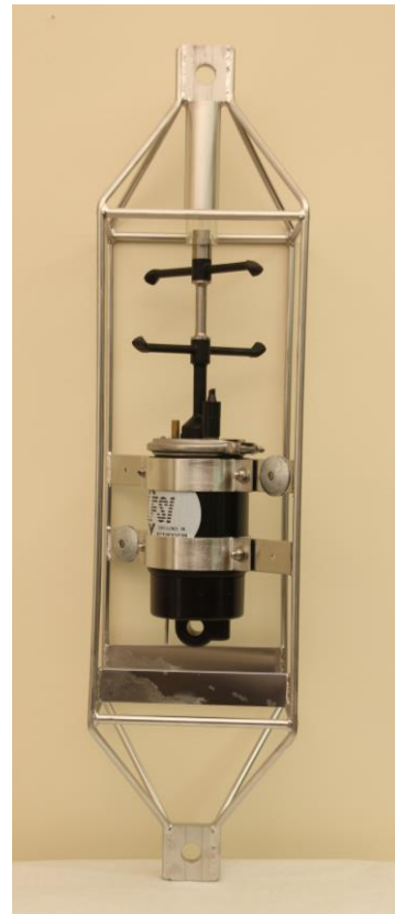
ACM-PLUS-300 shown with Integrated CTD and 5 Ton Frame Options

The ACM-PLUS is available in shallow, mid, or deep-water housings. The device may also be equipped with an optional pressure sensor, an optional CTD module, and can be configured to log up to two analog inputs from external sensors (e.g., DO, OBS, etc.).