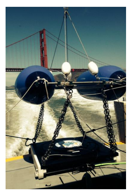
HMS-620LF Low Frequency Bubble Gun<sup>™</sup> Source Vehicle