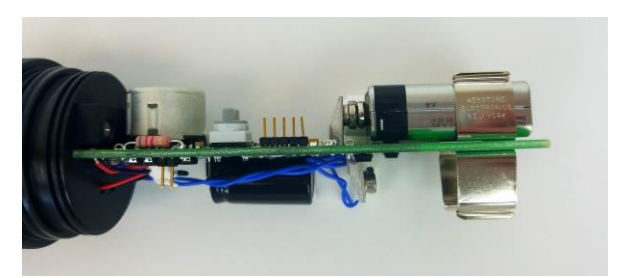
Figure 4-3 ULB-364 Battery Installation