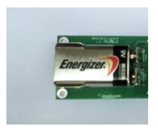
Figure 4-2 ULB-364 Battery Connections

Remove the old batteries and install the new batteries. Note the battery terminal orientation before making a connection. Ensure the battery terminals are fully seated.