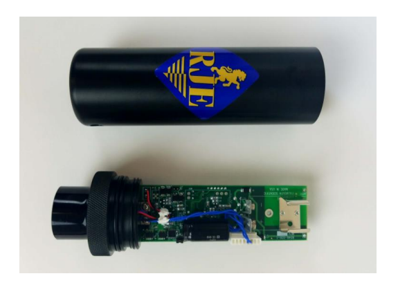
Figure 4-1 ULB-364 Disassembled

• Gently loosen and remove the transducer/PCB assembly from the housing.